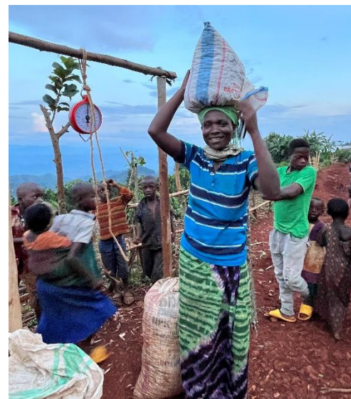
Farmer bringing her cherry to the collection site for weighing.

Starting with the first contract in 2016 for just 100 bags (60kg each, a total of six metric tons), Artisan has always paid a women's premium of thirty cents per kilogram of green coffee, (or 13.6 cents per pound). The premium only goes to female farmers, which Artisan justifies given the cost of production gap and benefits of cash transfers to women discussed above. Church has seen anecdotal evidence over the years that many in the co-operative acknowledge that women face more obstacles in society