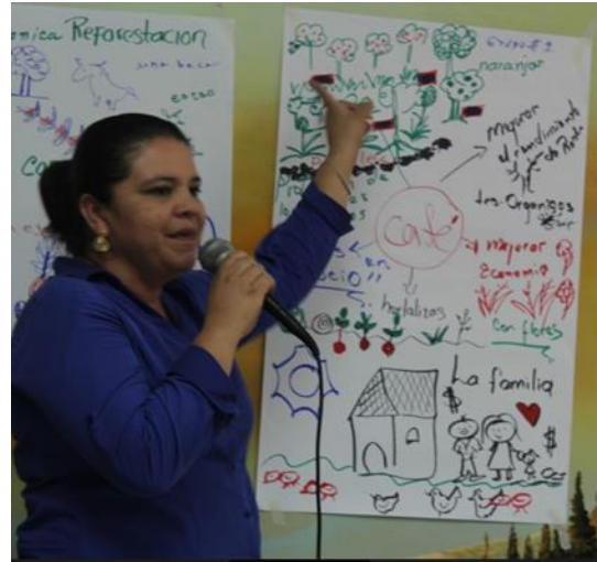
El Salvador coffee producer at a microfinance training.